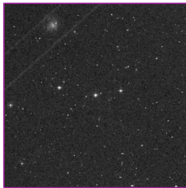
A Digital Sky Survey (DSS-2) image of the RU Vir field. The face-on barred spiral NGC 4688 lies about 15 arcminutes northeast of RU Vir.

RU Virginis (designation 1242+04, RA 12:47:18.4, Dec +04:08:41, J2000) is easily visible to both Northern and Southern hemisphere observers. The AAVSO has a BVRI Chart for RU Vir in addition to visual charts. RU Vir is currently approaching its bright phase, and it now varies between 9th and 13th magnitude over the course of its cycle. Like all carbon stars, it is much brighter in the red, and so it may appear brighter than it actually is to the eye. Be sure to observe it with a "quick glance" as is recommended in the AAVSO Visual Observing Manual . And as with all long-period variables, observations should be made about once every ten days. Visual estimates and instrumental photometry all provide important information for astrophysicists studying AGB stars, and RU Vir's long-term visual light curve is one of AAVSO's finest.