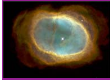
A carbon dust-rich planetary nebula, NGC 3132. RU VIR and other C-type AGB stars will end up like this in the not-too-distant future.

Since the AGB stars soon begin to return some of their mass to interstellar space , the study of carbon stars and other AGB stars is crucially important in understanding the chemical enrichment of the interstellar medium. In fact, most of the atoms that make up you were forged inside an AGB star billions of years ago before the birth of our solar system, so the physics of AGB stars is hardly an esoteric question. But the incredible complexity of the problem -- everything from the chemistry of dust grains to the acoustic behavior of extended stellar envelopes has to be taken into account -- means we still have a long way to go before we fully understand these objects.